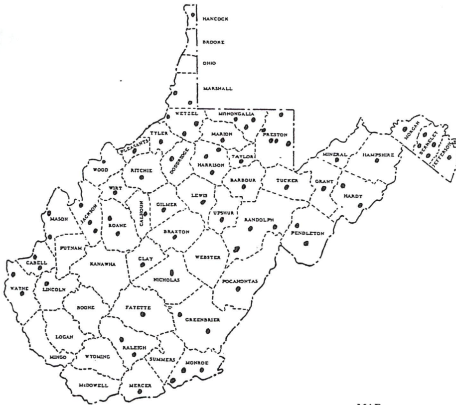
MAP SHOWING LOCATION OF FFA CHAPTERS IN WEST VIRGINIA